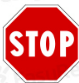
Stop and give way