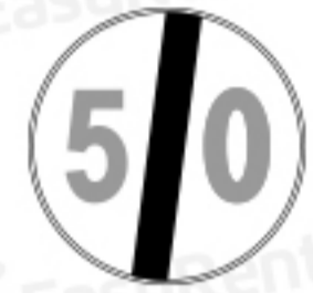
End of maximum speed