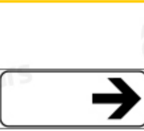
End of a danger or a prescription (horizontal)