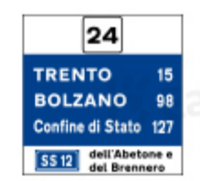
Main highway location marker and distances from next destinations