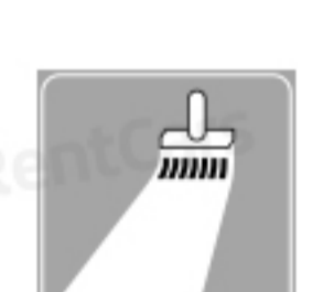
No road markings or road markings work in progress