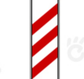
Level crossing countdown marker