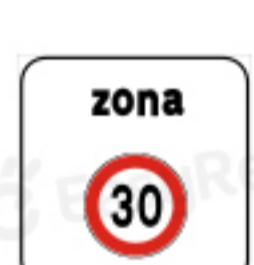
Start of a 30 km/h zone