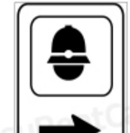
Direction to service shown in urban areas