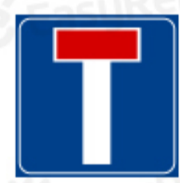
No through road