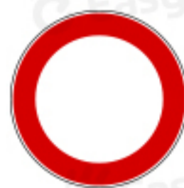
Restricted vehicular access