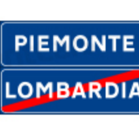
Regional boundary sign (roads other than motorways)