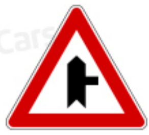
Junction with a minor side-road from right