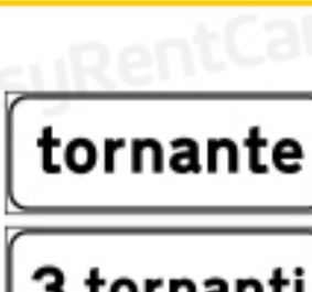
Hairpin turn ahead