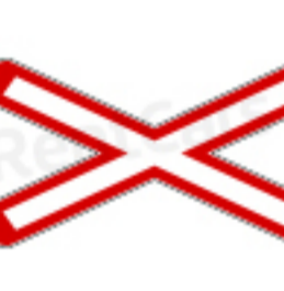
Single Level crossing