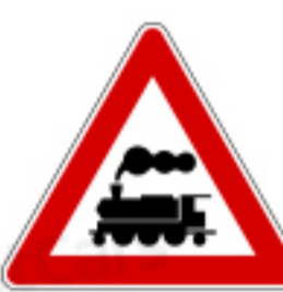
Level crossing without barrier or gate ahead