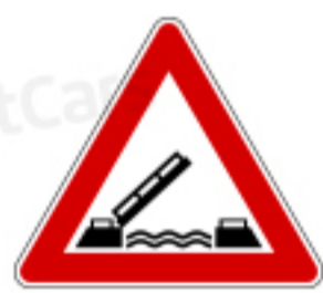
Opening or swing bridge ahead