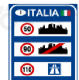
General speed limit (installed at national borders)