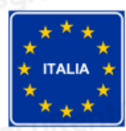
EU Country border

Note: Green signs for Highways (Autostrada), which are toll roads; Blue for non-toll roads; Brown signs usually suggest historic or tourist attractions.