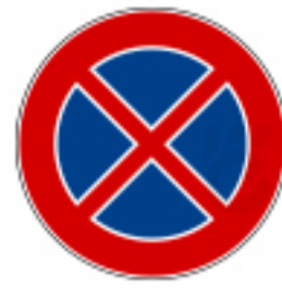
No stopping on the side where sign is placed