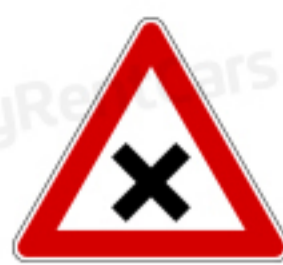
Crossroads with right-of-way from the right