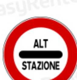
Stop, pay toll