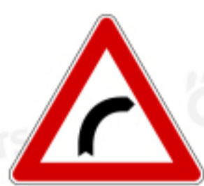
Bend, to right