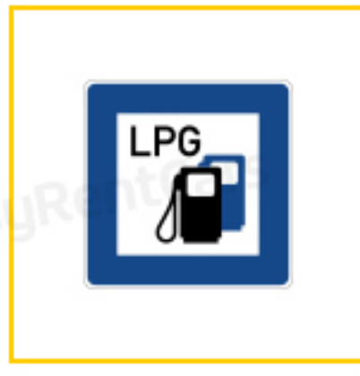
Petrol station with LPG