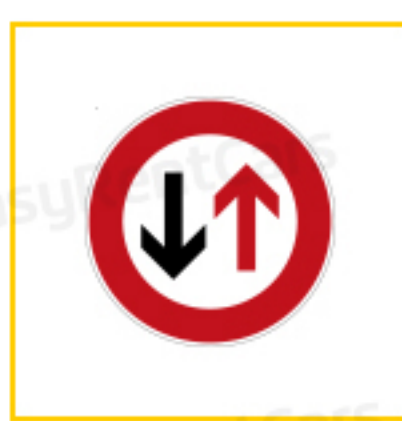
Oncoming Traffic, Red direction must yield