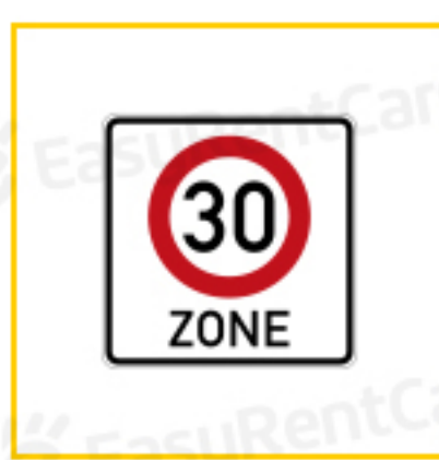
Maximum (30 km/h) Zone (still in effect after junctions)