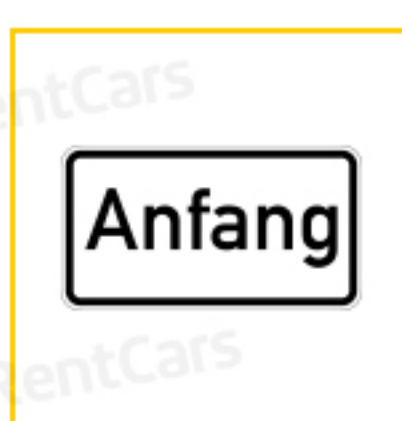
Start of restriction