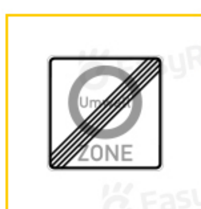
End of a low-emission zone