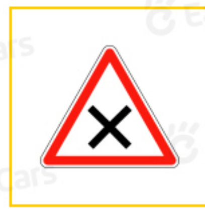
Crossroads with right of way from the right