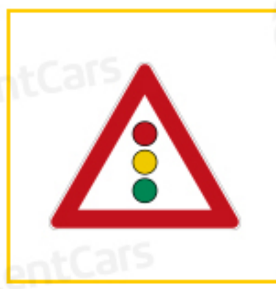
Traffic Signal Ahead