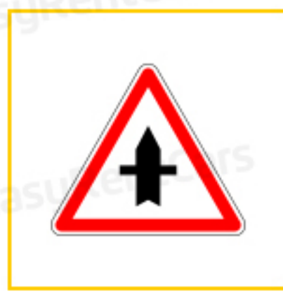
Crossroads with priority