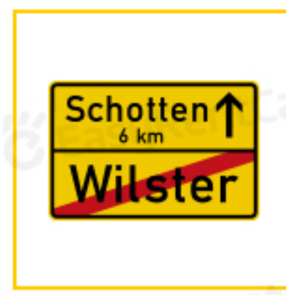
Leaving urban area