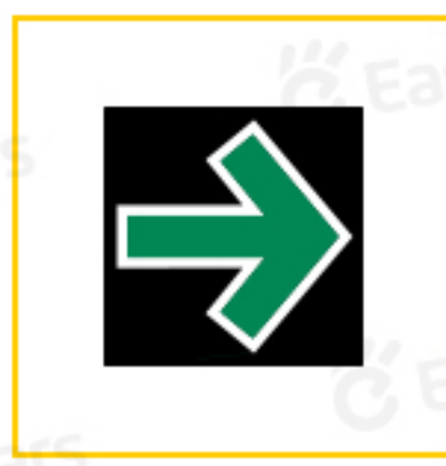
Right on red Only after a complete stop