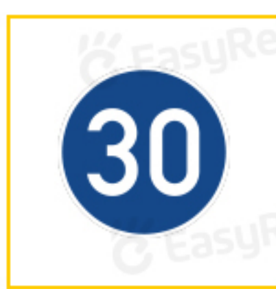
Minimum Speed Limit