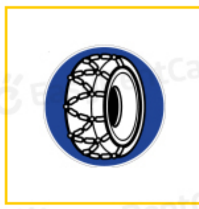
Snow chains or tires required