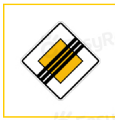
End of Priority road