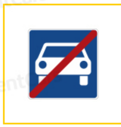
End of expressway