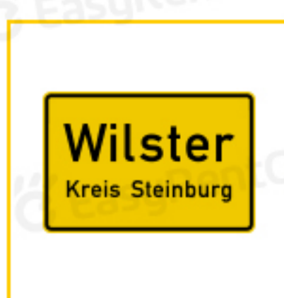
Entering urban area