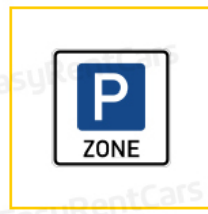
Parking management zone