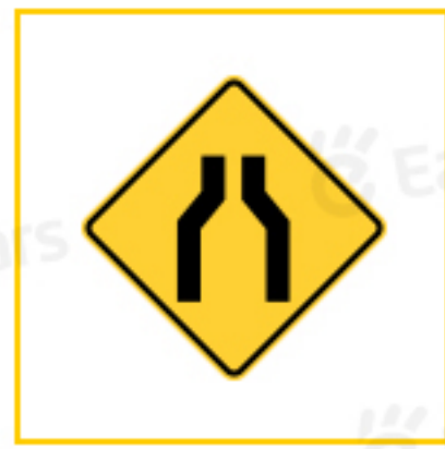
One lane road or road narrows, New York State