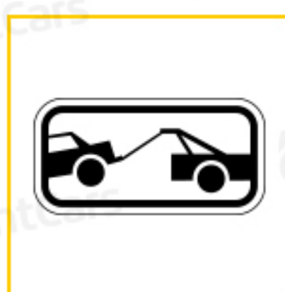
Tow Away Zone