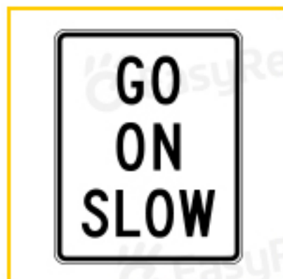
Go On Slow