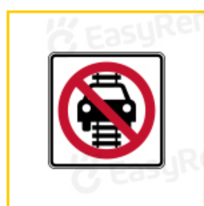
Do Not Drive on Tracks