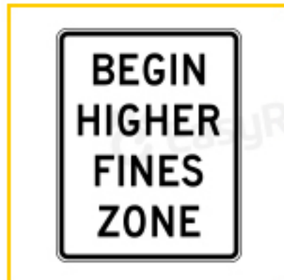
Begin higher/double fines