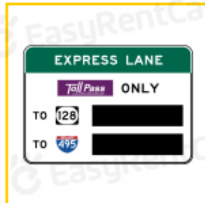
Toll costs at intersections or HOV 2+