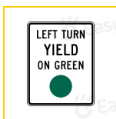
Left turn yield on green