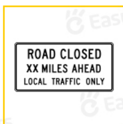
Road Closed Ahead