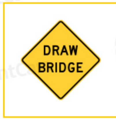
Draw bridge ahead