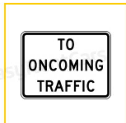
To Oncoming traffic