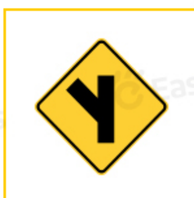
Side road at an acute angle