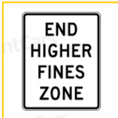
End double/higher fines