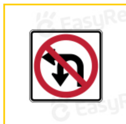
No Left or U-turn