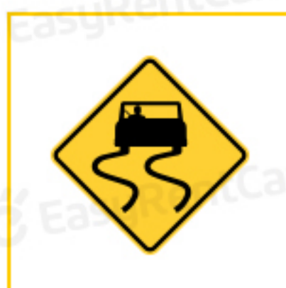
Road slippery when wet