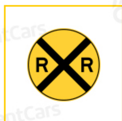
Railroad Crossing ahead