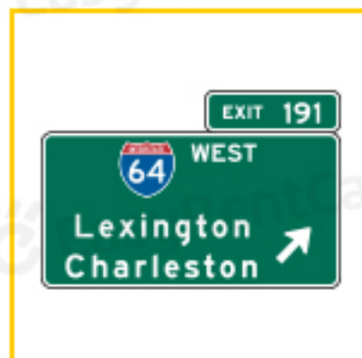
Interchange exit direction, Virginia