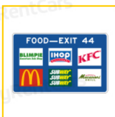
Specific service signs for food, gas, lodging, etc.