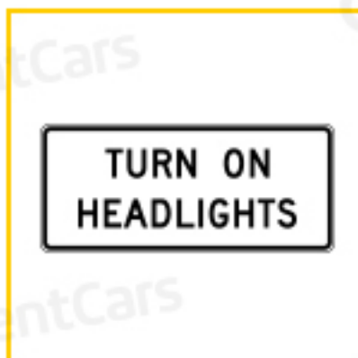
Turn on headlights