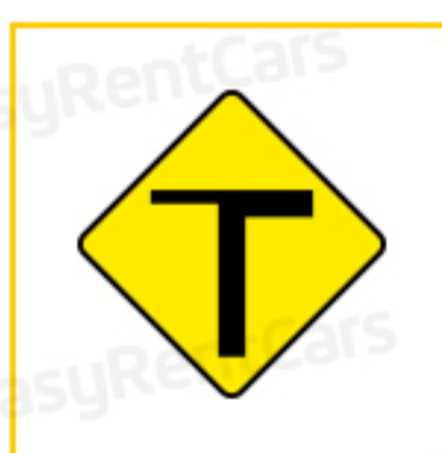
T-Junction (Type 1) - Left