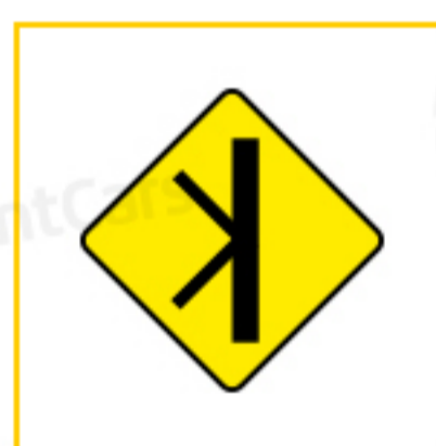
Merging and Diverging Traffic