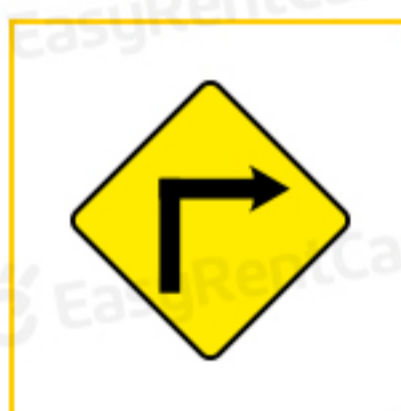
Sharp Corner - Right