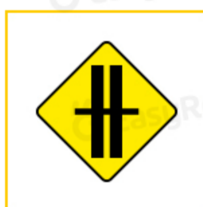
Crossroads on Dual C'way