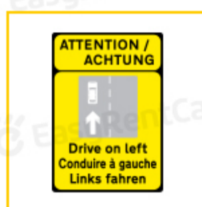
Drive on Left