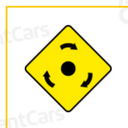
Mini Roundabout Ahead