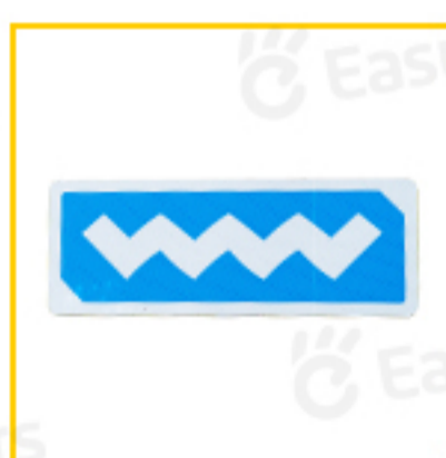
Wild Atlantic Way