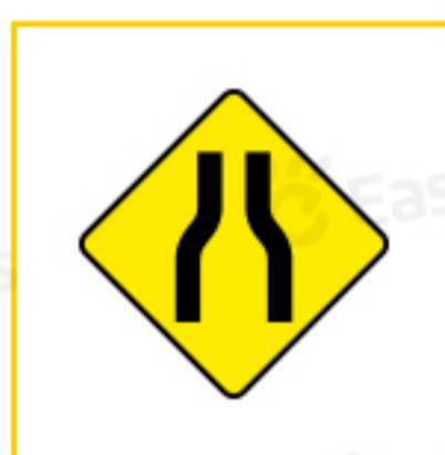
Road Narrows on Both Sides