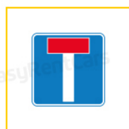
Road ahead is a dead end